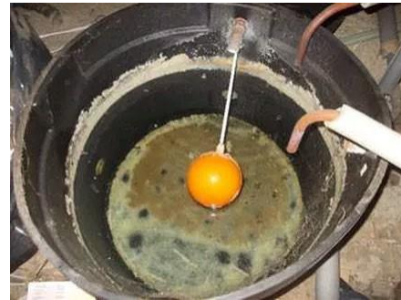
An example of build-up of sludge

Legionnaire's disease is normally contracted by inhaling legionella bacteria, usually in tiny droplets of water (aerosols) contaminated with legionella, deep into the lungs. Person-to-person spread of the disease has not been documented.